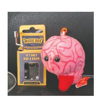
The little thinks: Itty-bitty brain, itty-bitty music box.

Winner gets the Clowning Achievement, our Style Invitational trophy. Second place receives a Mini-Brain Two-