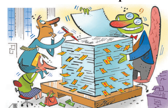
BOB STAAKE/ILLUSTRATION FOR THE WASHINGTON POST